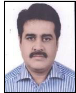
Principal of B.S.P.M.'S S.B.H.M.C.