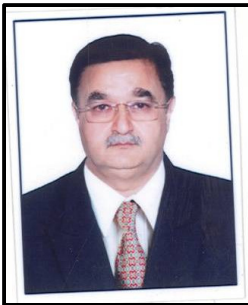
Secretary of B.S.P.M.

From 1997-98 started Post Graduate facility in Homoeopathy (M.D.Hom.) in three core subjects (i.e. Repertory, Homoeopathic Materia Medica and Organon of Medicine) and from 2007-08 in two core subject (i.e Practice of Medicine and Paediatrics) with and intake capacity 6 students each subject annually has been provided after the due recognition of Central Council of Homoeopathy, New Delhi, permission of Govt. of India and Govt. of Maharashtra, affiliation with Dr.Babasaheb Ambedkar Marathwada University, Aurangabad and Maharashtra University of Health Sciences, Nashik.